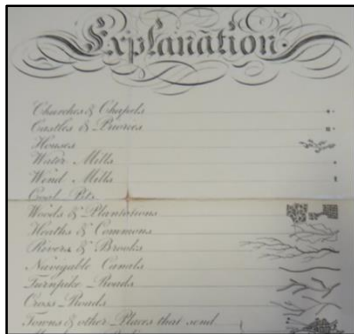
Extract showing the map key